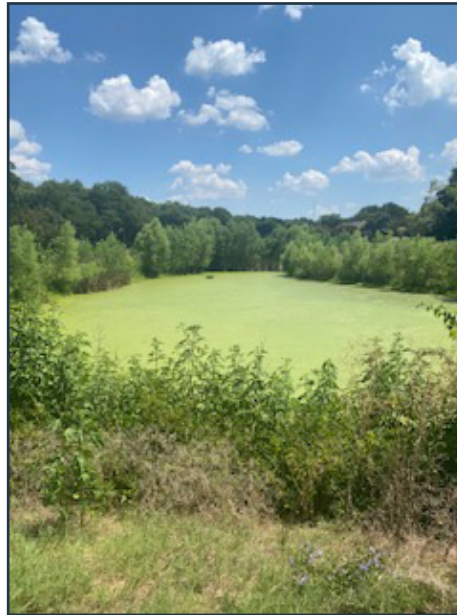
Stagnant pond in Woodhaven

All three ponds were treated to kill mosquitoes. Once the submersible pump is repaired, water will flow from the Trinity River, maintaining the ponds' water levels and preventing stagnant water from building up.