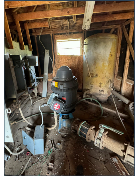
Current state of golf course irrigation pump