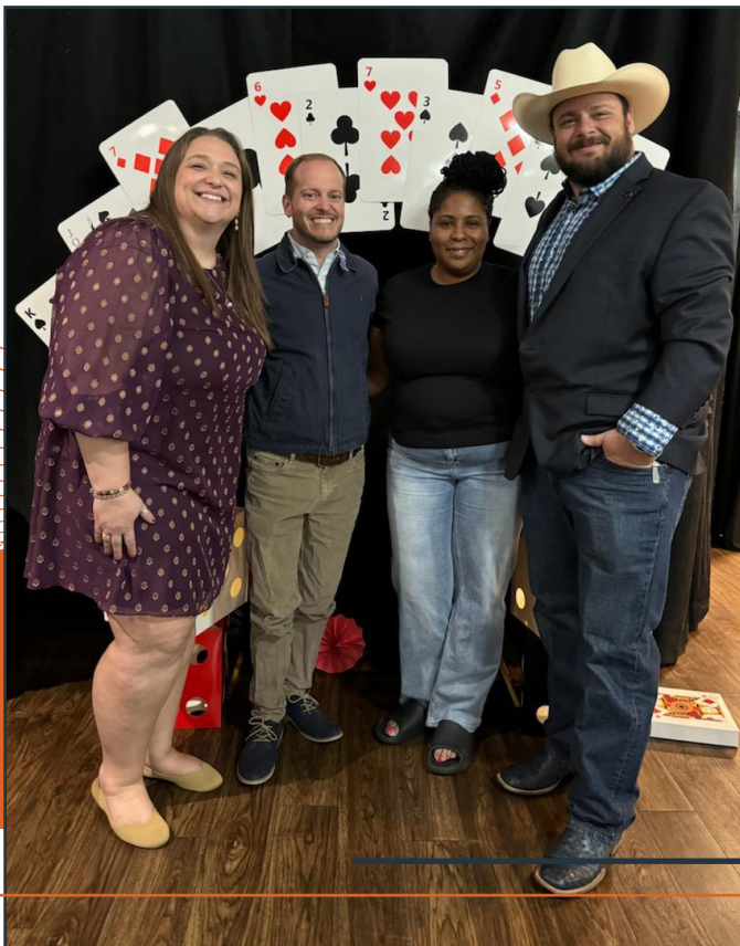
Woodhaven Neighborhood Association Casino Night