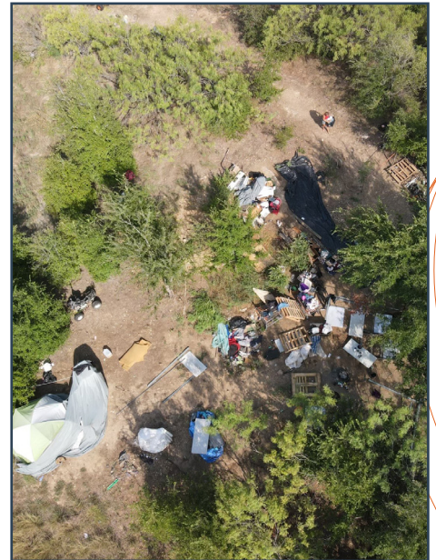
Brush and refuse before being cleared