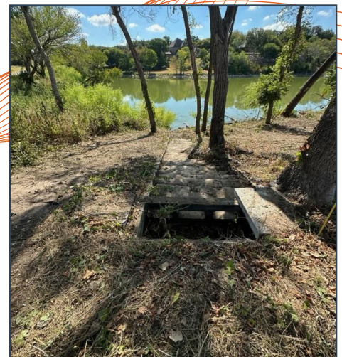
Repairs to submersible oxbow pump in Riverbend