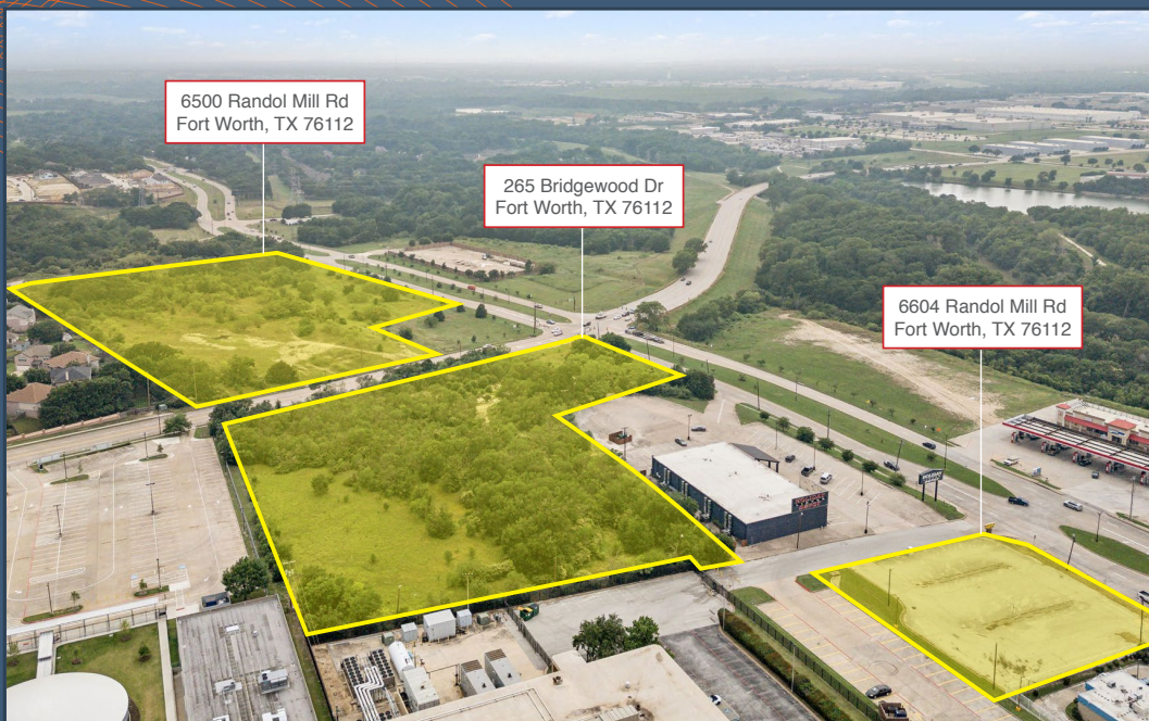
Crescendo Development's Three Woodhaven Commercial Properties